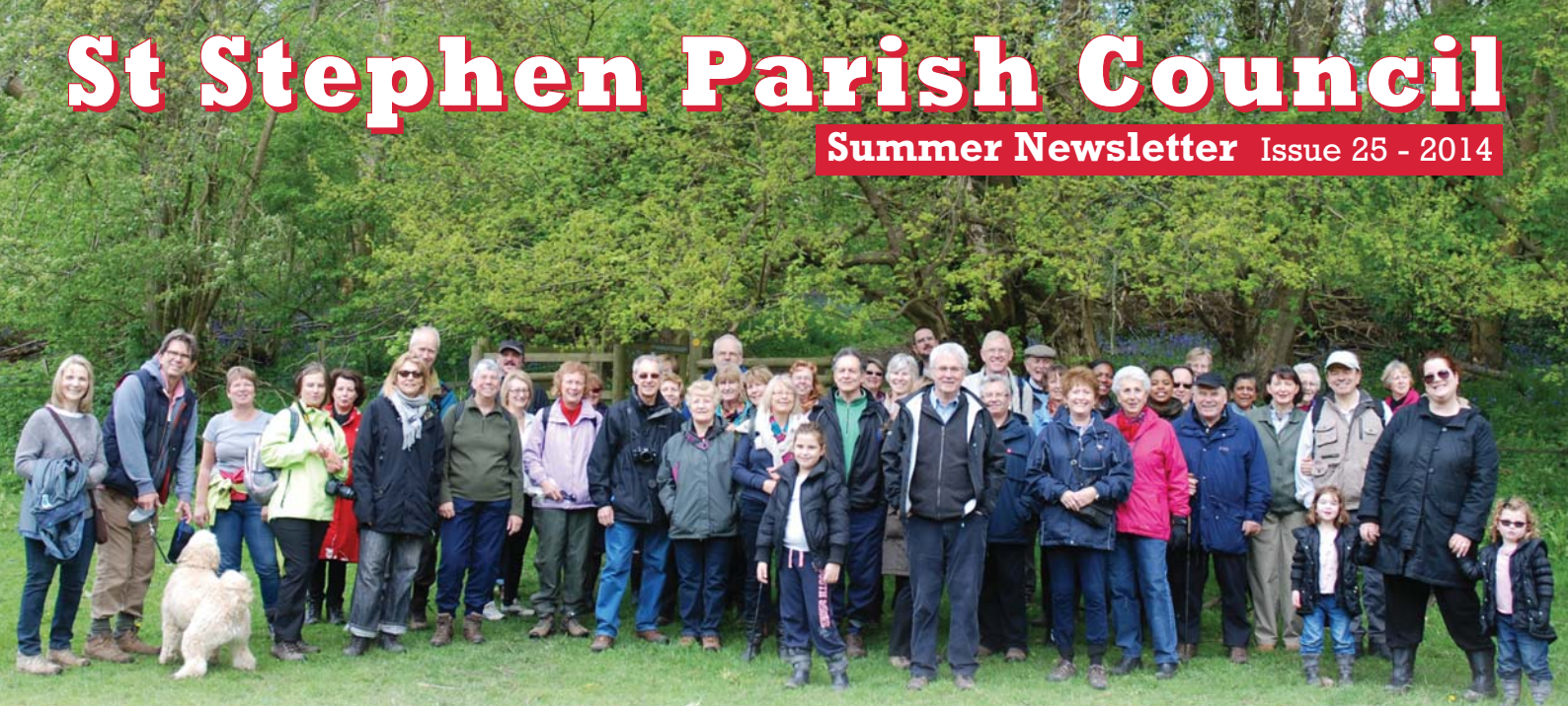
Parish Bluebell Walk