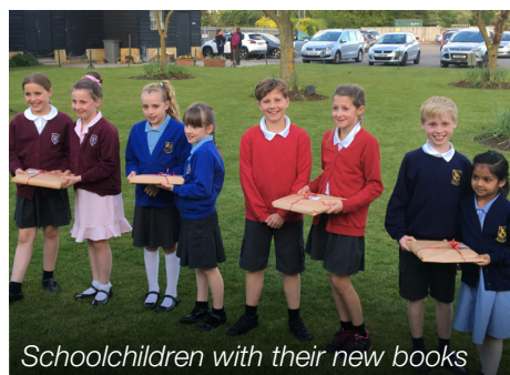
Schoolchildren with their new books