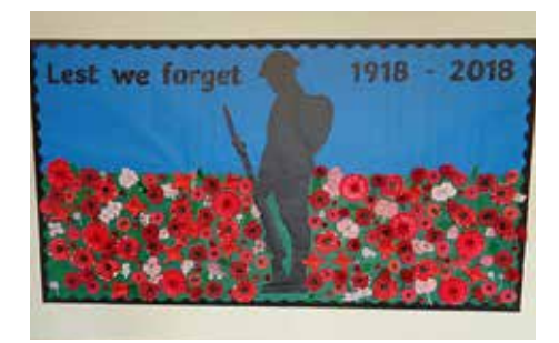
A work by How Wood School pupils, inspired by the Armistice centenary

Later, a beacon was lit at Greenwood Park as part of the chain of more than 1,000 'Beacons of Light' symbolising the hopes for peace that emerged with the signing of the Armistice. The free community event, attended by around 1,000 people, reflected the celebrations that took place throughout the country 100 years ago and included a BBQ, bar, film show, large memorabilia display and fireworks.