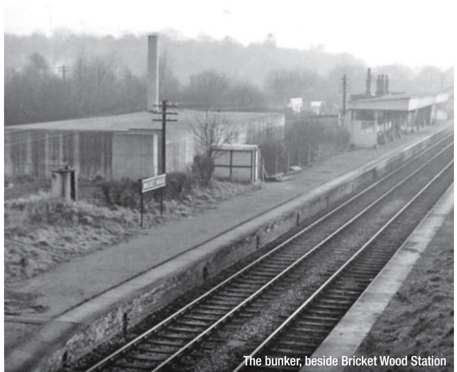
The bunker, beside Bricket Wood Station

Matched funding is being applied for from various sources to help with the restoration and internal alterations. But you can help to bring this disused building to life by becoming a member. See the website ( www.bricketwoodstationtrust.org.uk ), which contains a wealth of information about the station and the work of the trust.